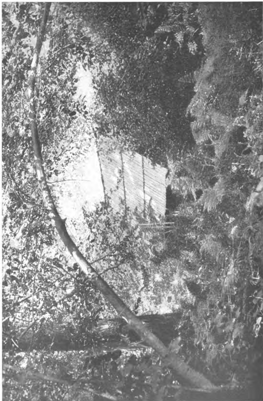
JOHN MUIR'S CABIN IN THE YOSEMITE