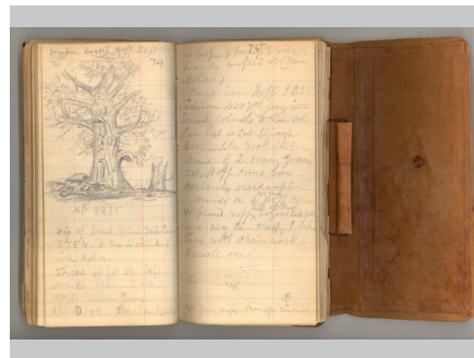
Journal. Yosemite Journal, 1872. John Muir Papers, Holt-Anderson Special Collections, University of the Pacific Library.