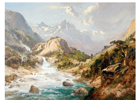
William Keith. Mount Ritter (Crown of the Sierras) . Oakland Museum of California, Gift of the Keith Art Association.