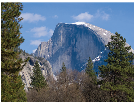
Stephen Joseph. Detail, Half Dome, Yosemite National Park. 2009. Photograph.