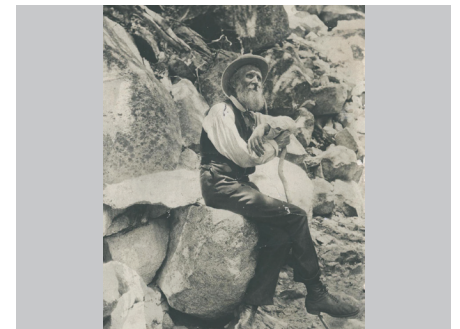
John Muir. Detail, Archival Photograph.