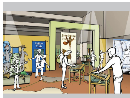
A Walk in the Wild: Continuing John Muir's Journey exhibition design. 2011. Oakland Museum of California.