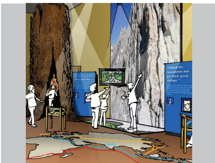
A Walk in the Wild: Continuing John Muir's Journey exhibition design. 2011. Oakland Museum of California.