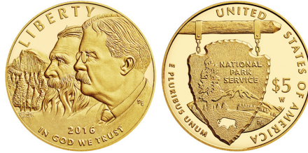
2016 National Park Service Centennial Gold Coin